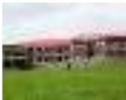
Photos of fully installed Roof