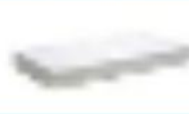
Single bed mattress