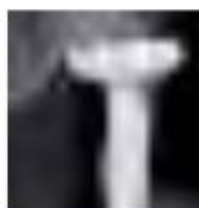
Wash Hand Basin