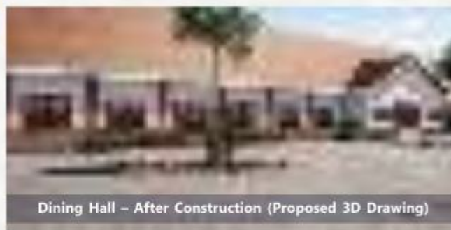
Dining Hall – After Construction (Proposed 3D Drawing)

Construction work on the Dining Hall has seen much progress. Currently, it is at the roofing stage and the metal trusses for the roof is under installation. You may recall that the old Dining Hall was demolished and a brand new one is rising in its place (please see photos below).