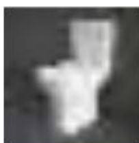
Close Couple WC

These packages include the furniture, mechanical items required in each of the buildings and the energy centre.